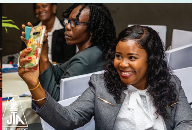
These two participants thought that the best way to enjoy the day was to submit a selfie of themselves to friends back home