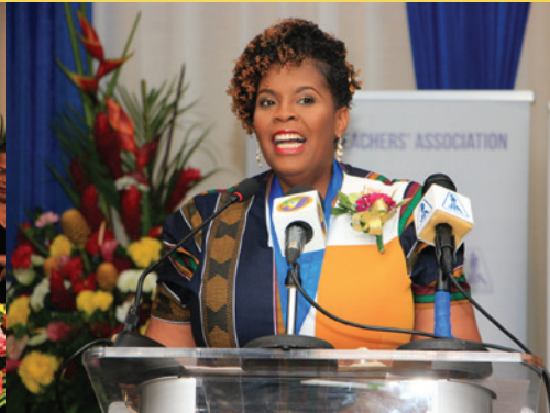
The new President addresses Conference