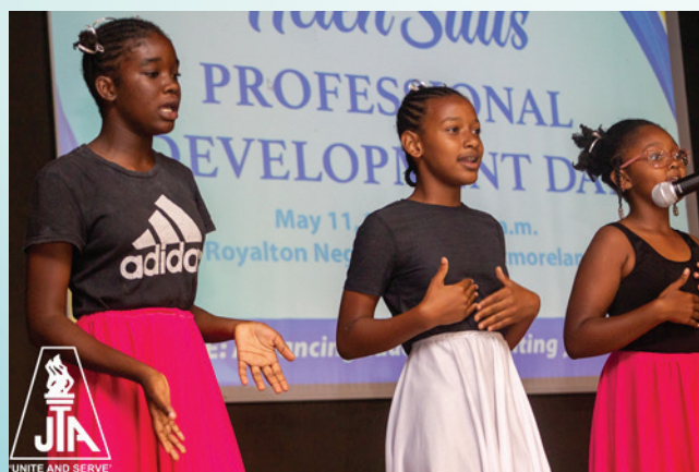
Some of the students who were invited to entertain the audience are seen here presenting their piece to the audience